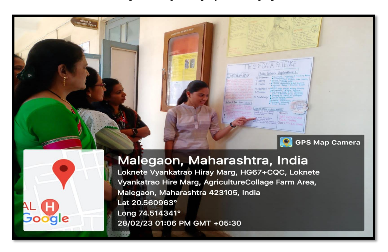
Student presenting their project through poster