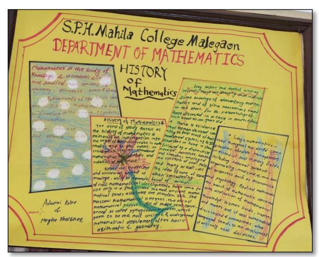
Posters of the Students