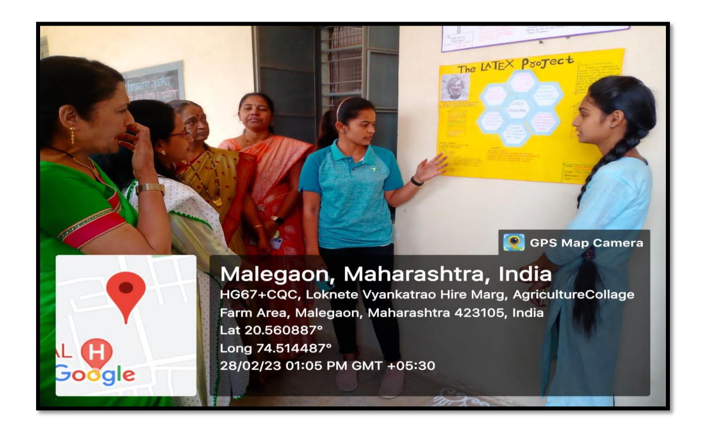
Student presenting their project through poster